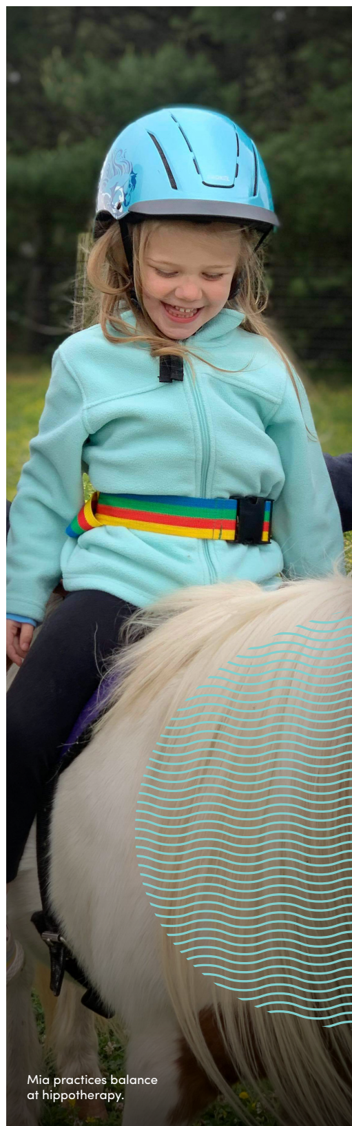
Mia practices balance at hippotherapy.