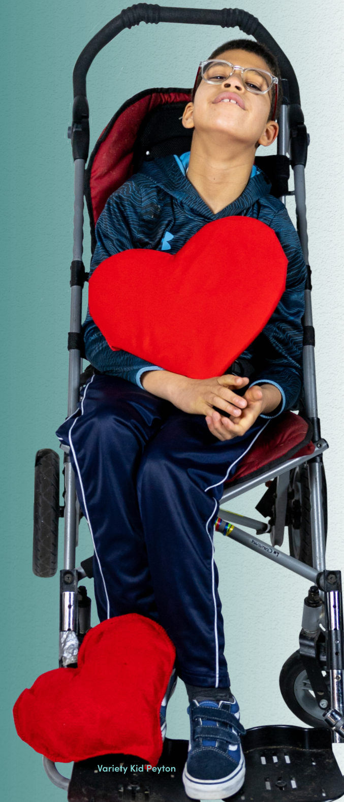
Variety Kid Peyton

Variety expanded theatre programming to a record 33 participants, and along with Chorus and Dance, provided 3,101 hours of free professional mentorship