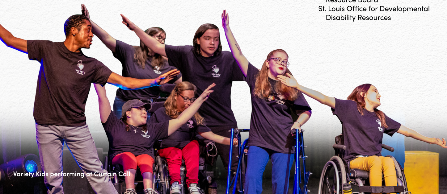
Variety Kids performing at Curtain Call