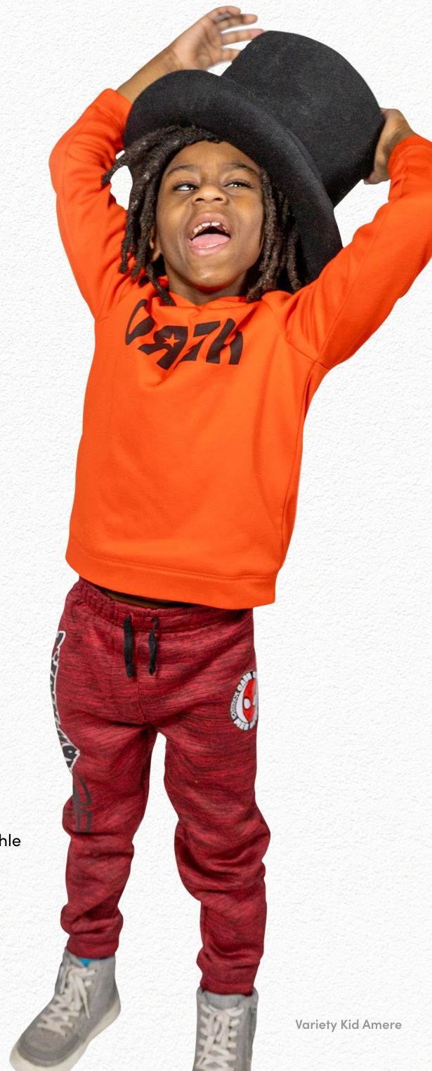
Variety Kid Amere