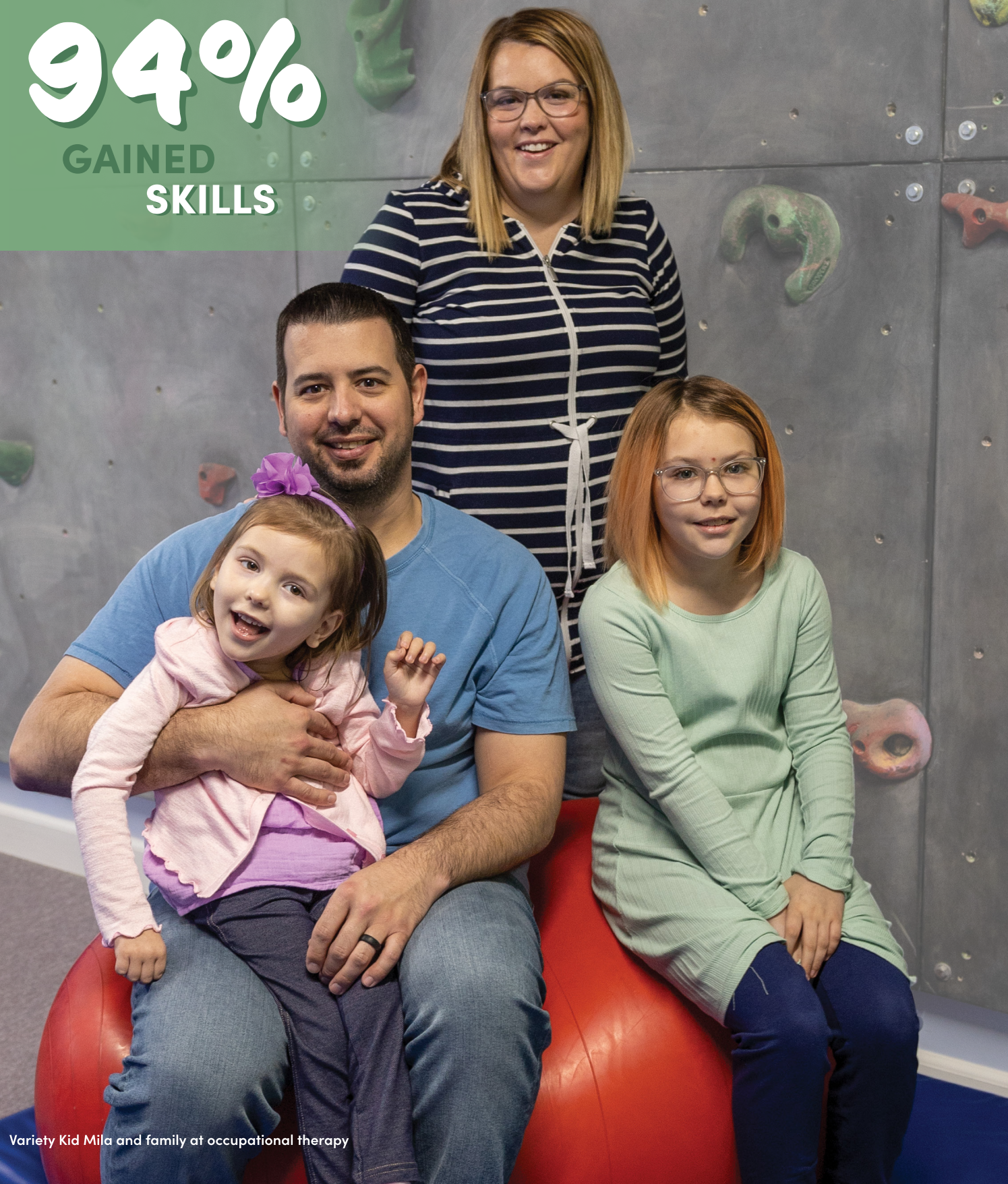
Variety Kid Mila and family at occupational therapy